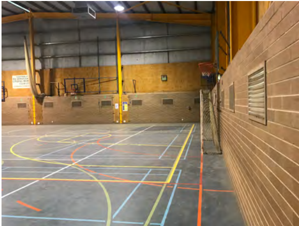
Indoor court marked for multiple sports