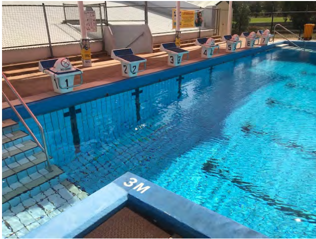
Diving blocks and step entry in 50m outdoor pool