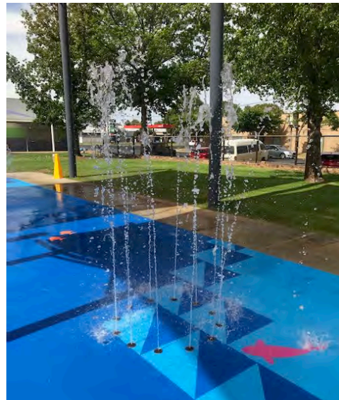
Ground sprays at outdoor splash pool at Cootamundra Swimming Pool.

(See Appendix 4 for further images of centres.)