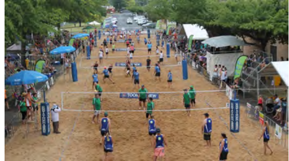
Cootamundra Beach Volley Ball 2018