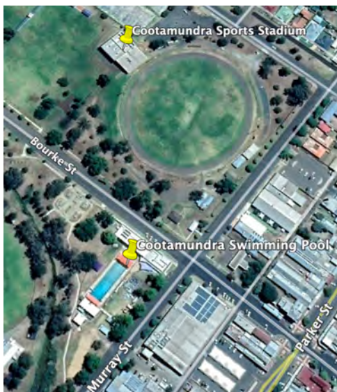
Figure 1 Aerial view of Sports Stadium, Clarke Oval and Cootamundra Pool to south.

The sites are approximately 200 metres apart separated by Bourke Street and Fisher Park. The Council manages both facilities.