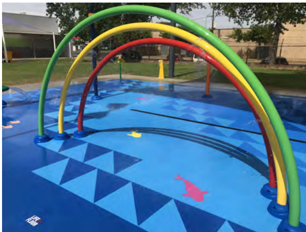
Outdoor splash pad opened November 2019