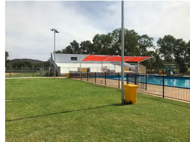
Grass area looking towards Swim Club room