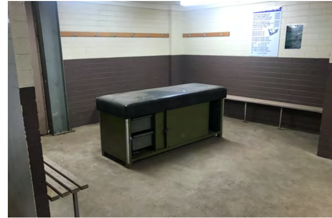
Stadium change rooms shared with oval user groups